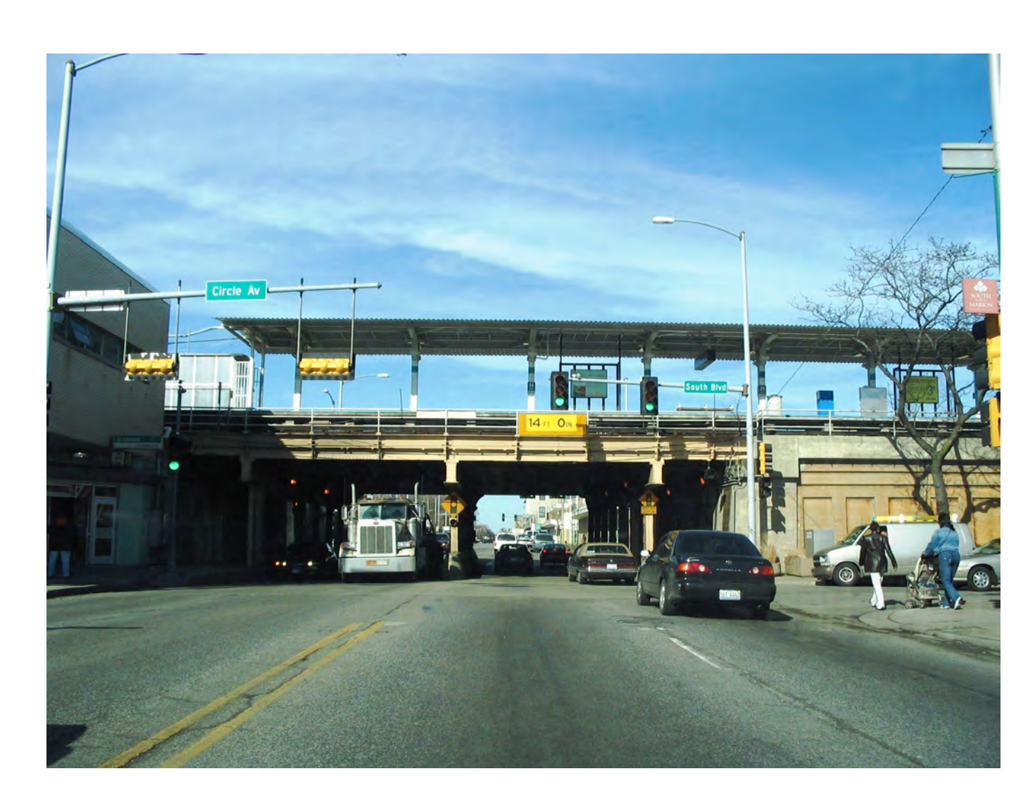
Harlem Avenue underpass looking north