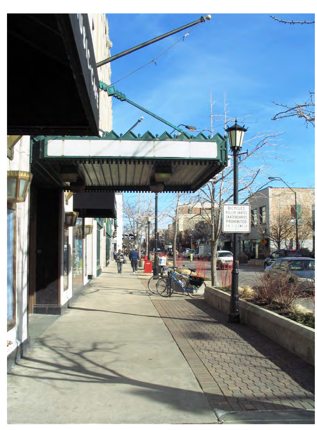
Example of streetscape enhancements (Lake Street, Oak Park)