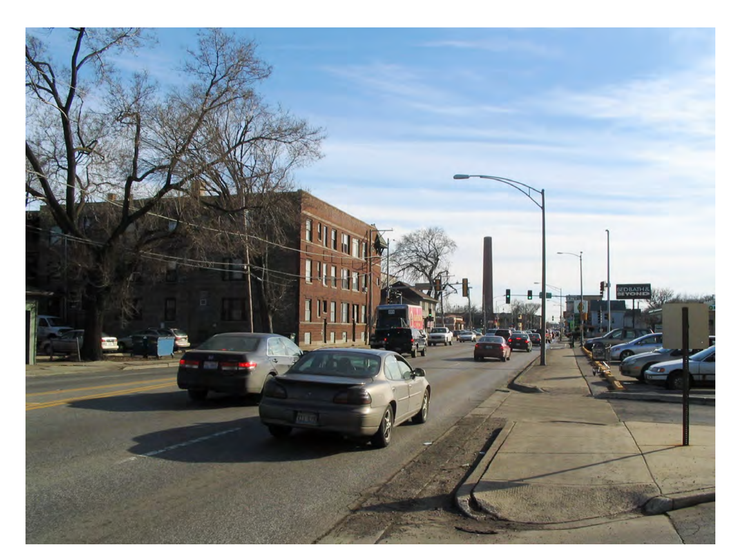
Harlem Avenue south of the underpass looking south