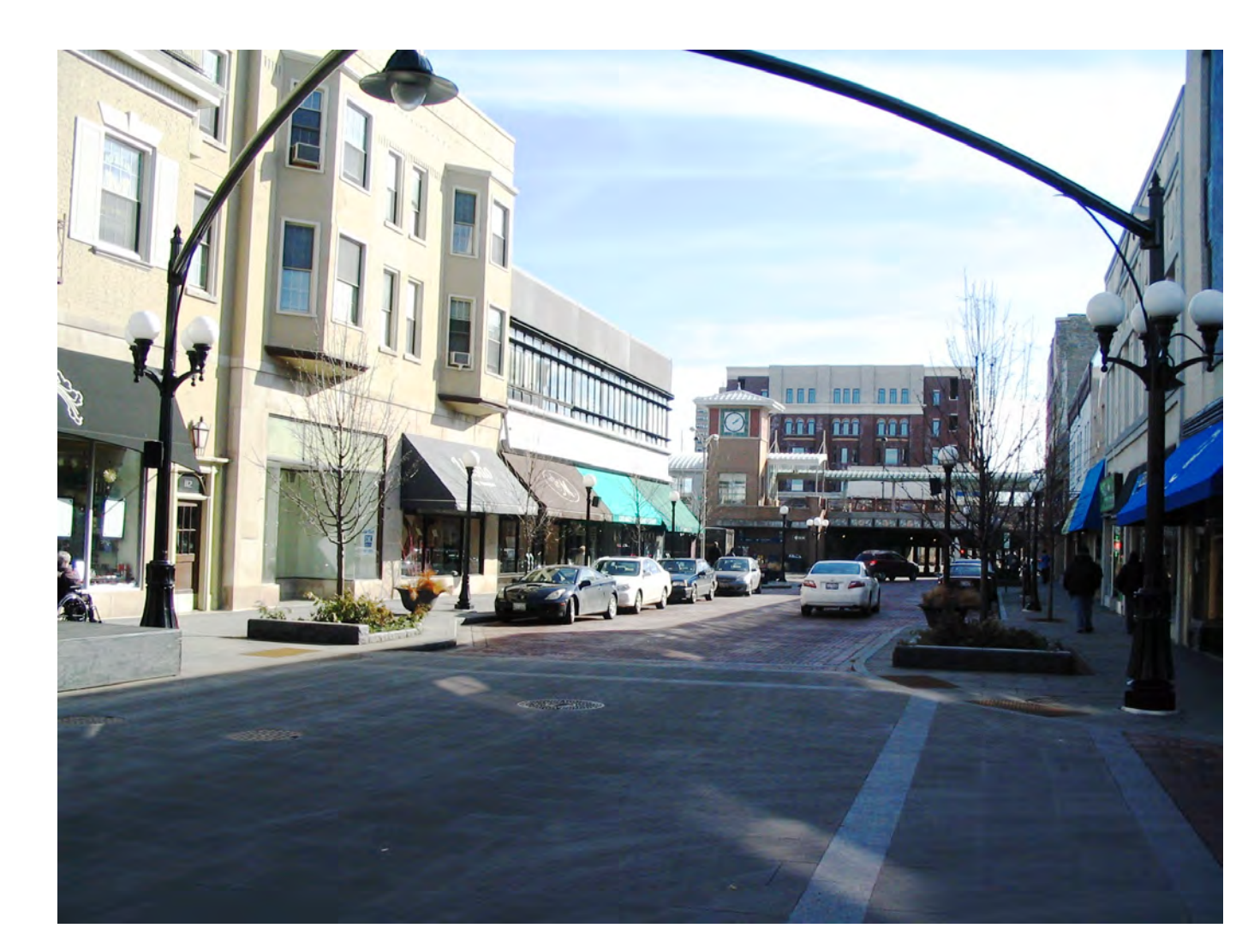
Example of a space that balances pedestrian and motorized traffic. (Marion Street, Oak Park)