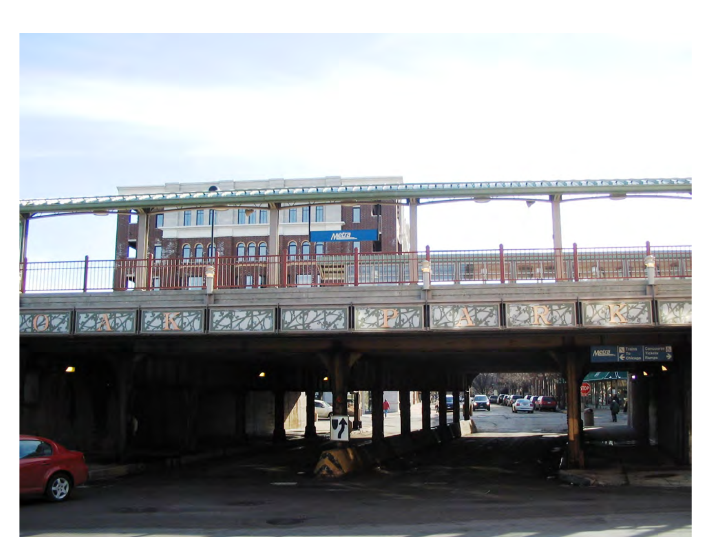
Example of facade and railing enhancements on a railroad structure (Oak Park Metra Station)