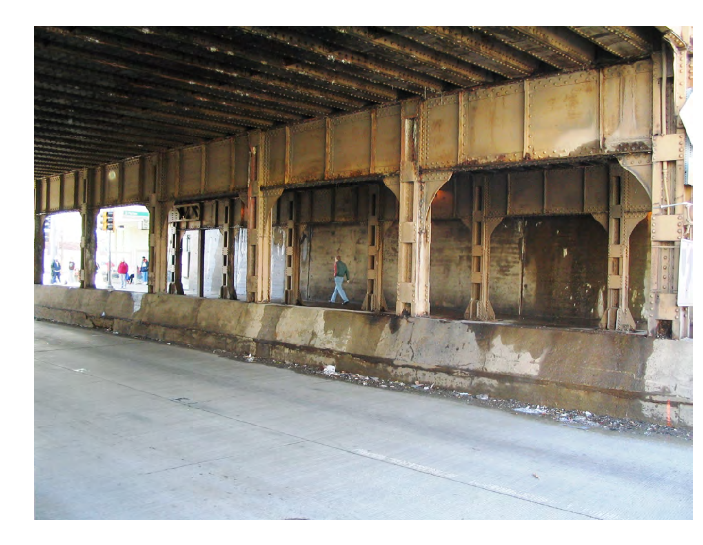
Underpass piers and columns